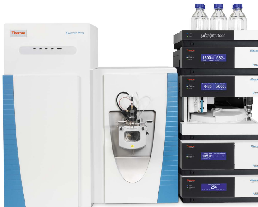
Exactive Plus mass spectrometer with Thermo Scientific™ Dionex™ UltiMate™ 3000 Rapid Separation LC system