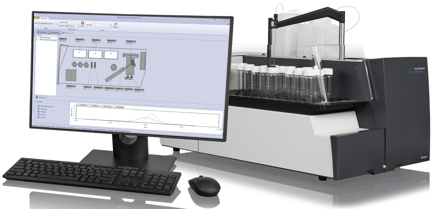
Configuration: XPERT with Computer*